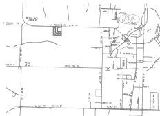
VICINITY MAP Pea Ridge National Battlefield State Park Center: Jackson, Ark.

MAP ORIGINALLY FILED IN THE OFFICE OF THE CLERK OF THE PEA RIDGE, ARK. ON 11/17/1970 BY 3749-7489